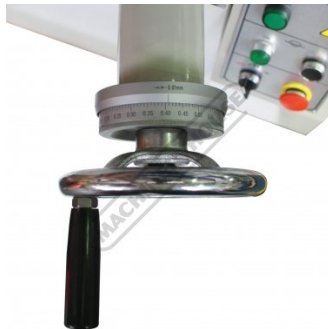
Vertical Travel Dial 0.01mm Graduations