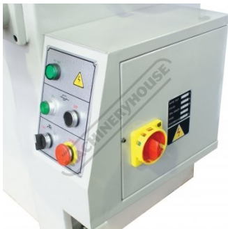
Electrical Cabinet with Stop Switch