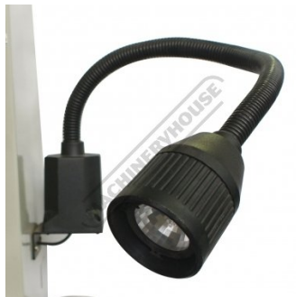
Flexible Halogen Work Light