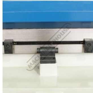
Table Feed Stops