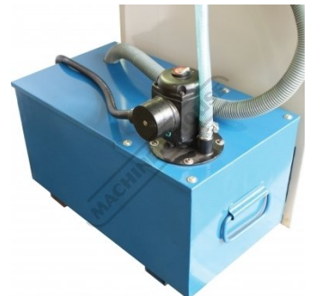
Coolant Pump & Tank