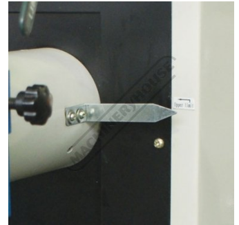
Height Upper Limit Guide