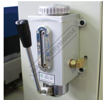
One Shot Oil Lubrication