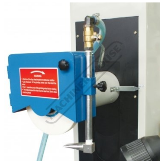
Wheel Coolant Nozzel