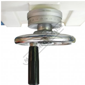
Cross Travel Handle 0.02mm Graduations