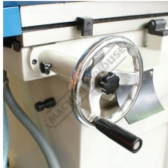
Manual Table Feed Hand Wheel