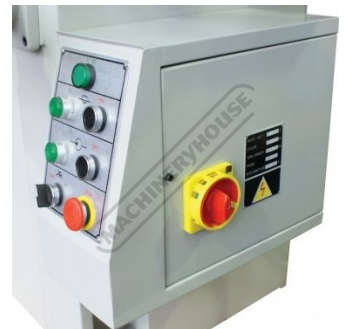
Electrical Box with Stop Switch