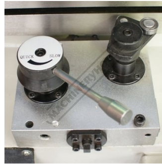
Hydraulic Feed Control