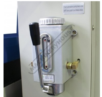
One Shot Oil Lubrication