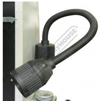
Halogen Work Light