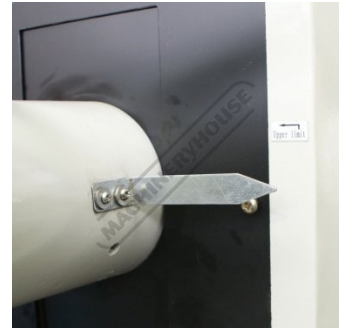
Upper Limit Guide