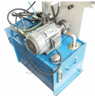
Hydraulic Unit & Coolant Tank