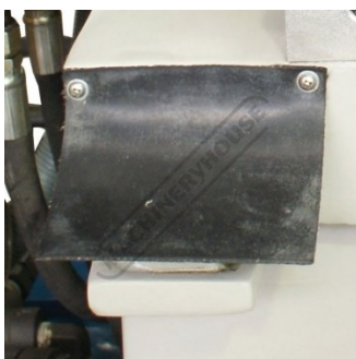
Cross Slide Covers