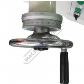
Vertical dial 0.01mm graduations