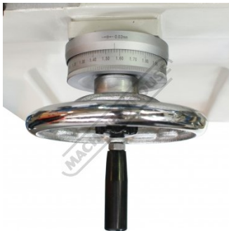
Cross travel Handle 0.02mm graduations