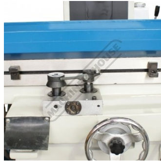
Table Feed Stop System