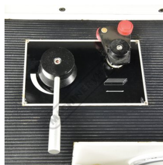
Hydraulic Table Feed Control