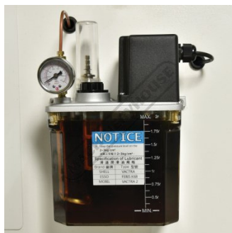
Auto Lubrication Pump