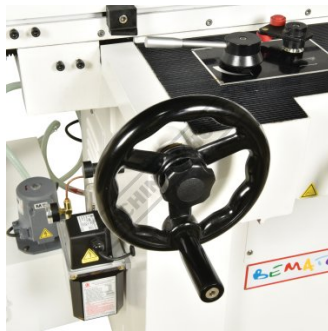
Table Direction Hand Wheel