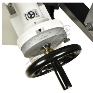
Fine Feed Height Adjustment Dial