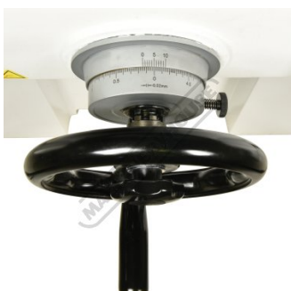
Cross Feed Dial