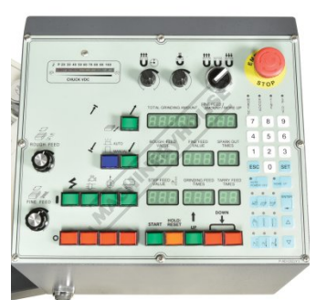
Programmable AD5 Controller