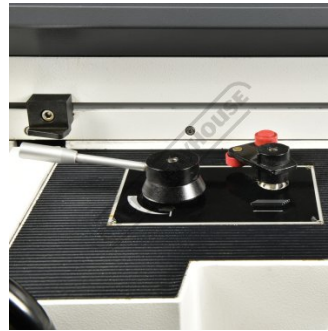
Table Direction Adjustable Stops