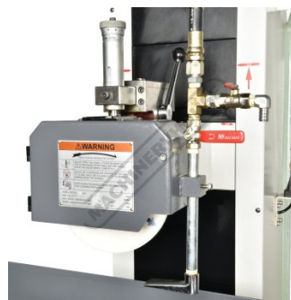
Grinding Wheel Enclosure Guard