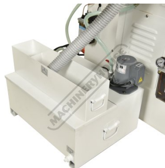
Coolant Pump and Tank