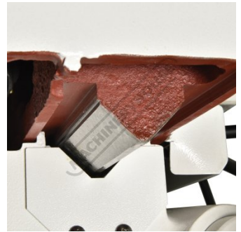
Large Table Vee Slide with Turcite B Coating