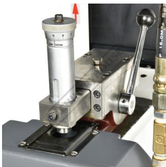
Wheel Dresser with Micro Adjustment