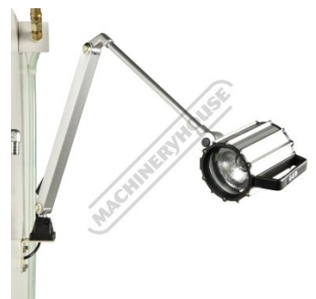
LED Work Light