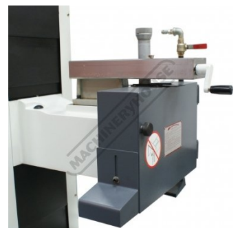
Micro Adjustment Wheel Dresser