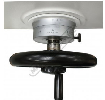
Cross Feed Dial