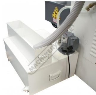
Coolant Pump & Tank