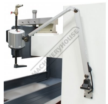
LED Work Light