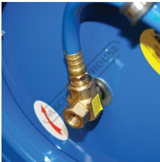
Side Air Inlet