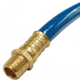
Air Hose Fitting