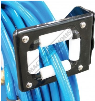
4 Way Roller Guide