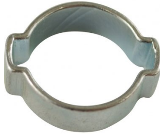
F888 Air Fittings