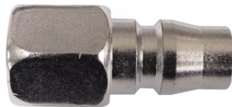
F950 High-Flow Air Fittings