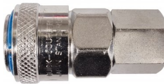
F945 High-Flow One Touch System Air Fittings