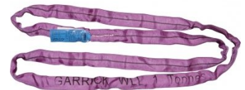
H305 Round Sling