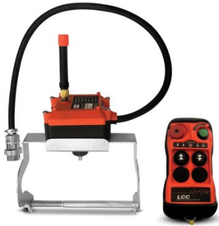
H259A Wireless remote t/s builders hoist