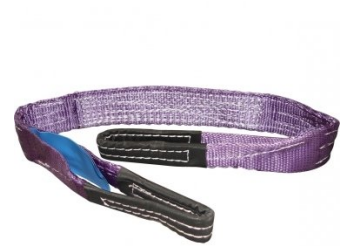
H316 Flat Slings