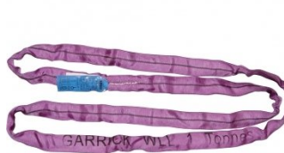
H308 Round Slings