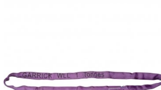
H300 Round Slings