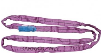
H305 Round Slings