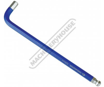
Metric Hex Key