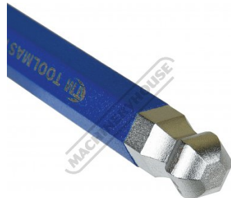
Ball End Hex Profile