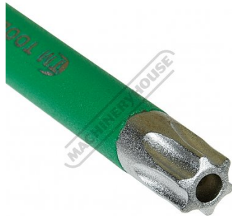
Torx Profile Botton End