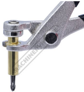
Shown using a Cleco Fastener