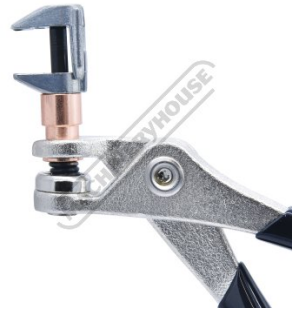
Shown using a Side Grip Clamp