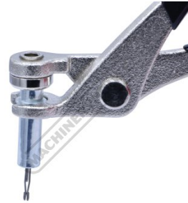
Shown in Cleco Fastener Pliers