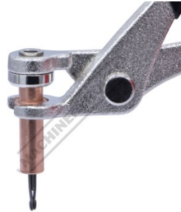
Shown in Cleco Fastener Pliers