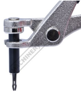
Shown in Cleco Fastener Pliers