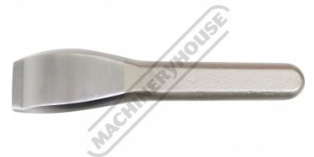
Drip Moulding Spoon