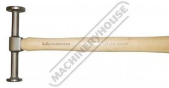
Fender and Panel Dinging Hammer