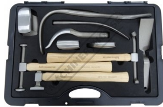
Shown in Box