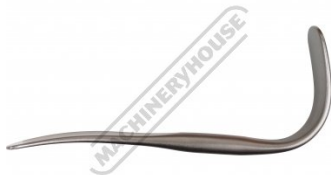
Angle and Flat Short Double Spoon