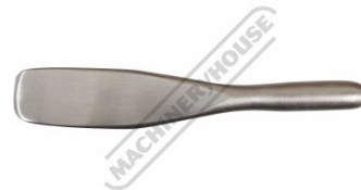
Short Single Spoon