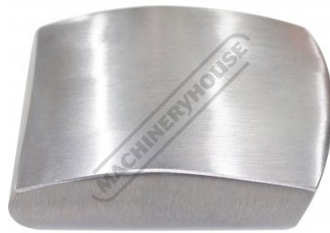
High Crown Dolly