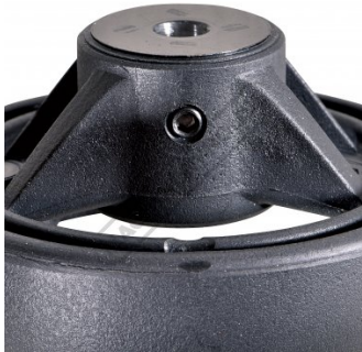
Grub Screw Attachment