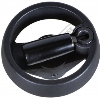
Handle Folded Flat