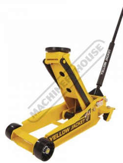
Front View Lifted