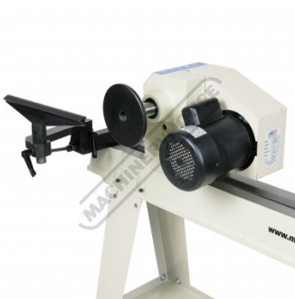
Bowl Turning Set Up Right View Close Up