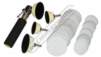
BSS 5075 Bowl Sanding Tool