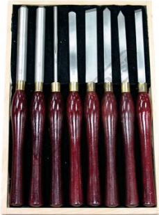
WT 8 HSS Wood Turning Tool Set