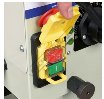
Switch On Off