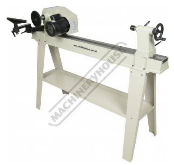
Bowl Turning Set Up Right View