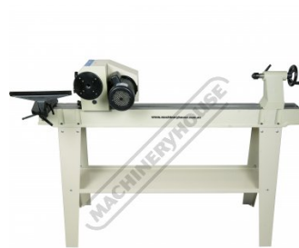
Bowl Turning Set Up Front View