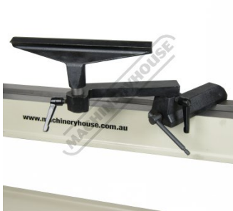
Outrigger Tool Rest