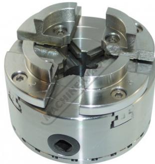
WSC 100 Scroll Chuck