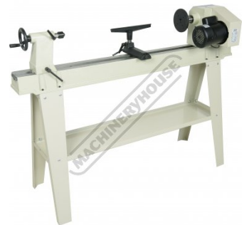
Rear Left View