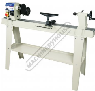
Shown with Standard Tool Rest