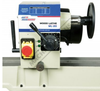
Headstock Front View