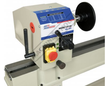
Headstock Left Top View