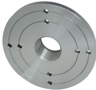
W298 Face Plate