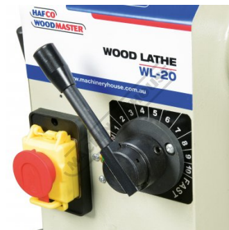
Variable Speed Lever