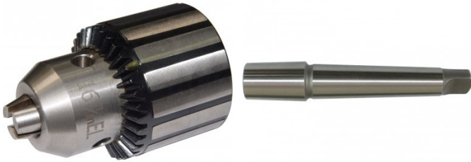
D442A 2MT x JT3 Drill Chuck Arbor