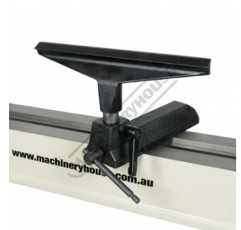
Standard Tool Rest