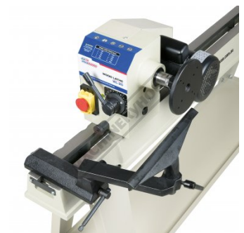
Bowl Turning Set Up Top View