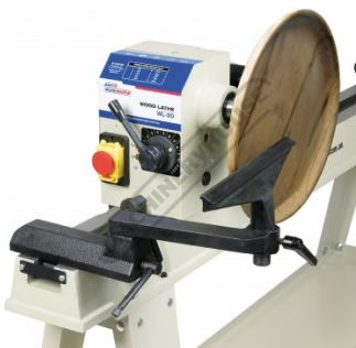
Shown Set Up with Bowl