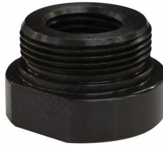
SCI 10 Scroll Chuck Insert