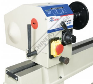
Headstock Left View