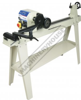
Bowl Turning Set Up Left View