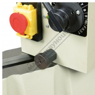
Swivel Head Release Lock