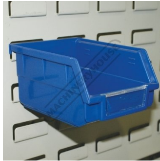
Plastic Bucket Container