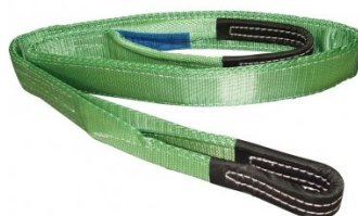
H322 Flat Sling