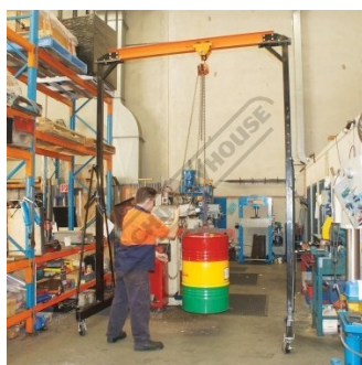
Shown Lifting Oil Drum 2