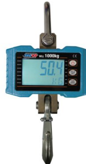
C191 Digital Crane Scale