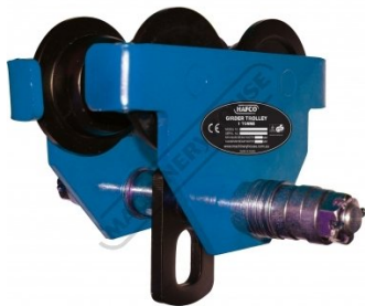
Includes 1T Girder Trolley