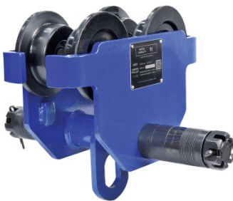
C147 Girder Trolley