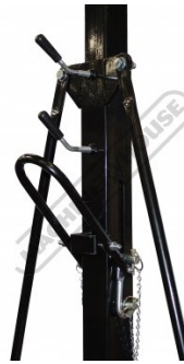
Lever Action Beam Height Adjustment