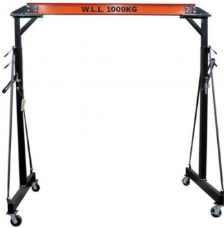
K088 Mobile Girder Rail Gantry Package Deal