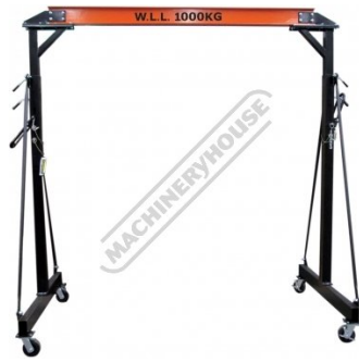
Mobile Girder Rail