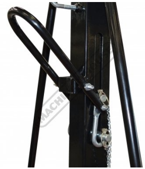
Safety Height Locking Pins