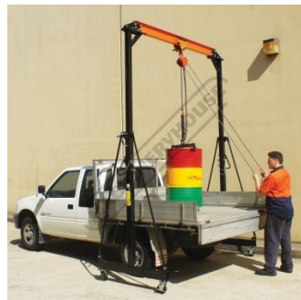
Shown Loading Oil Drum onto Ute