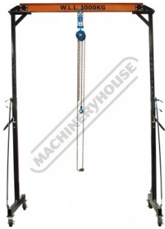
Shown at Full Height