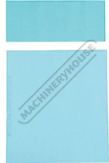
Inner-Outer Spare Cover Lens