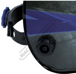
Harness Tightening knob