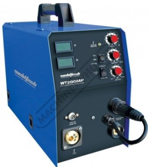
Mig Welder WT200MP