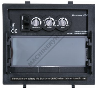
Electronic Shade Lens Sensor Controls