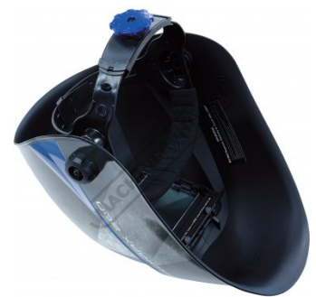
Rear Side View Head Gear