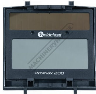
Front View of Electronic Shade lens