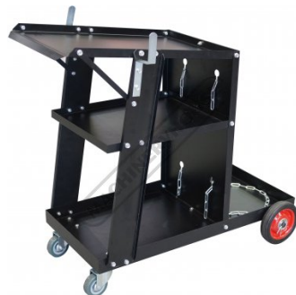
WTU-500 - Welder Trolley