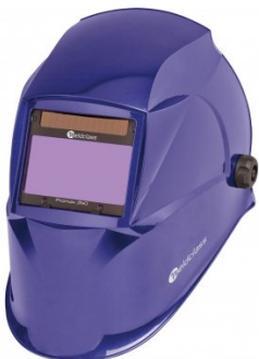
W002 Auto Darken Welding Helmet - 9~13 Shade