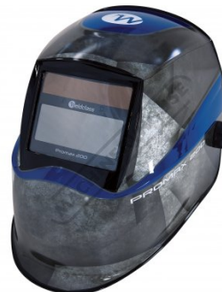
PROMAX 200 - Auto Darken Welding Helmet Front View