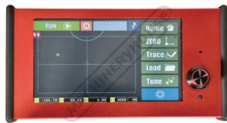
Touch Screen Interface