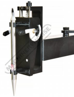
Trace Pen In Holder