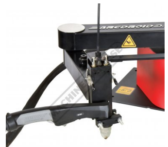
Plasma Torch Cradle