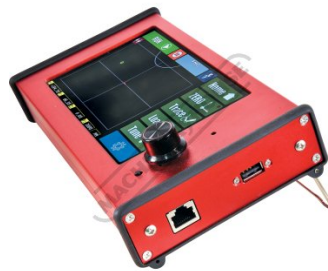
Import Via USB