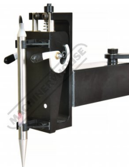
Trace Pen In Holder