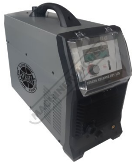
ADVANCEDCUT 125 - Plasma Cutter