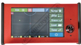
Touch Screen Interface