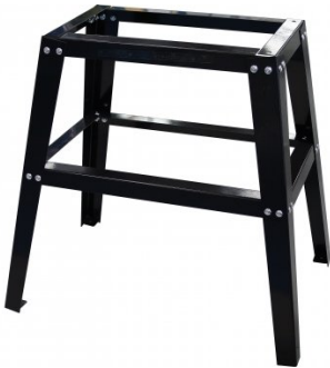
W810 Universal Tool Stand