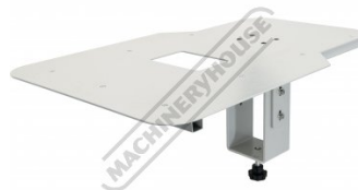
MBR-FWT - Steel Support Work Table