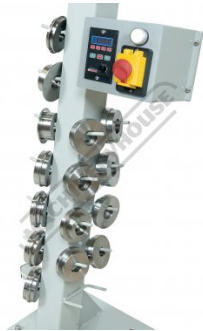
Die Rack Holders Right View