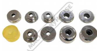
MBR-10K - Forming Bead Roller Kit