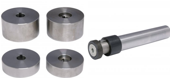
S6336 Mandrel Roller Holder