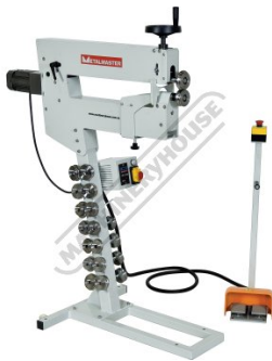
MBR-610XT - Bead Roller