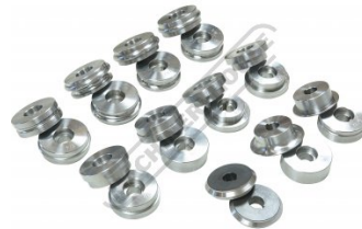
Profile View Of Die Sets