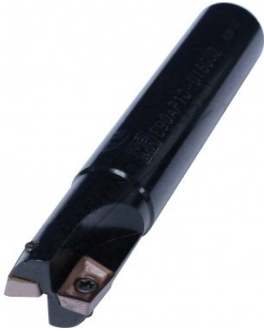
End View M520