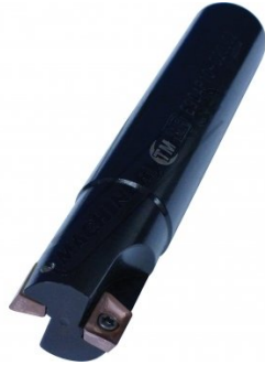
End View M521