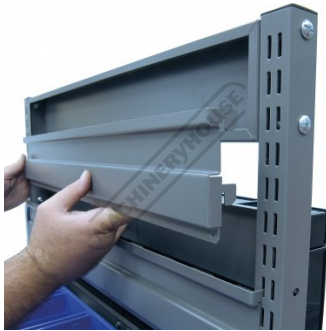
Optional Bracket Shown Clipping Onto Frame