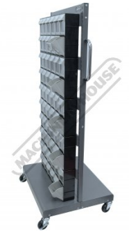
Right Side View Two Buckets Open