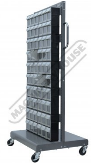
Right Side View Buckets Open