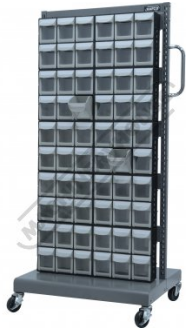
Few Buckets Shown Open