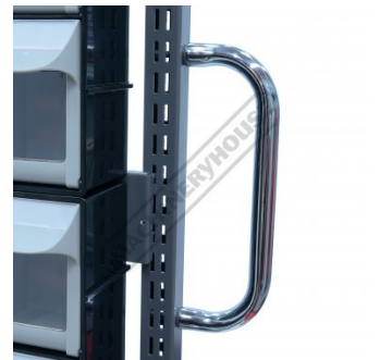
Chrome Handle Mounts on Left or Right Side