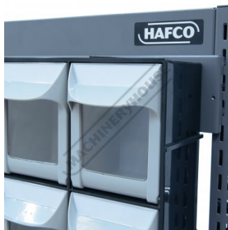
Medium Size Bins