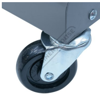
2 x Swivel Wheels