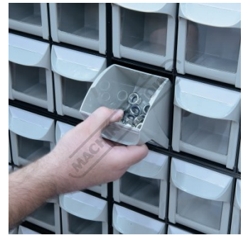
Removable Bins For Easy Access & Refilling