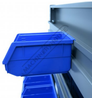
Bucket Shown Clipped Onto Bracket