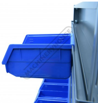
Bucket Shown Clipped Onto Bracket