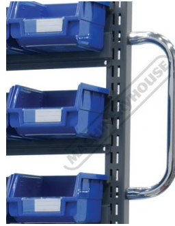
Chrome Handle Mounts on Left or Right Side