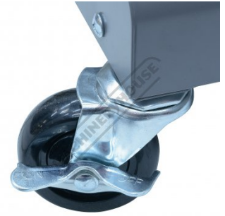
2 x Swivel Wheels with Brake