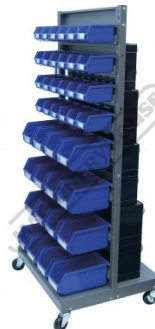
Shown with Optional BK-46MF Storage Bin System S0351