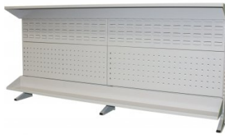
A426 Industrial Backing Panel - Bench Mount