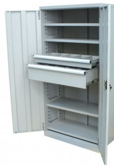
T762 Industrial Storage Cupboard