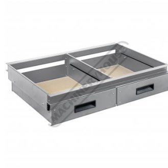
Shown with Drawers Closed