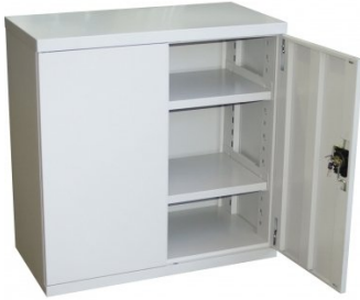
T774 Industrial Storage Cabinet