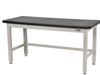
A420 Industrial Work Bench