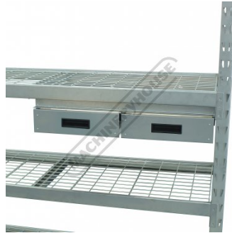
Shown Mounted to Racking with Drawers Closed