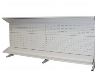
A426 Industrial Backing Panel - Bench Mount