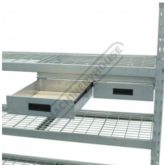
Shown Mounted to Racking with Drawer Open