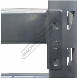
External Shelf Locking System