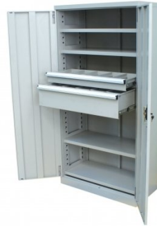
T762 Industrial Storage Cupboard