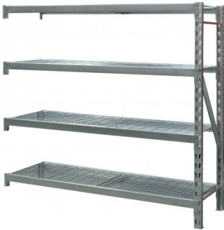
S014A Industrial Steel Shelving Extension