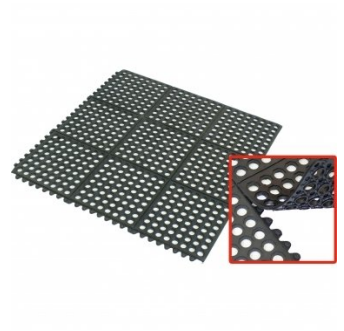
M805 Rubber Mat - Anti-Fatigue