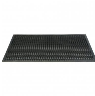
M800 Rubber Mat - Anti-Fatigue