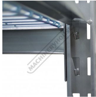
Internal Shelf Locking Wedge Type System