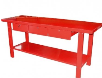
A380 Steel Work Bench - 3 x Lockable Drawers