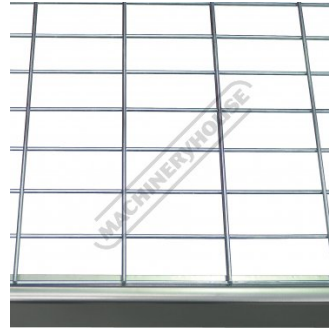
Shelf Wire Mesh