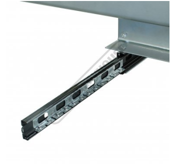
Ball Bearing Slides