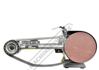
Adjustable Belt Tensioner