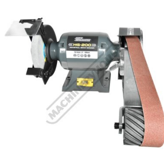
Large Work Surface-Quick Action Belt Change