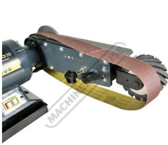
Quick Release Belt