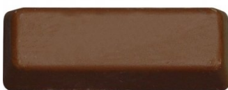
G320 Brown Buffing Compound