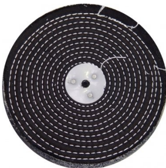
G186 Buffing Mop