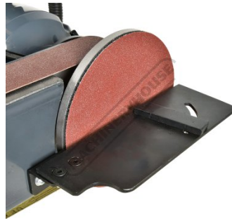
Adjustable Mitre Table