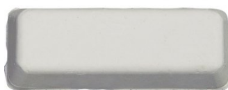
G327 Light Blue Buffing Compound