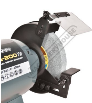
Adjustable Eye Shield Tool Rest