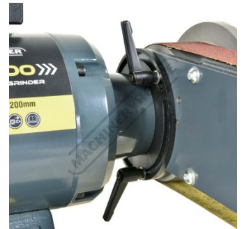
Quick Release Angle Adjustment