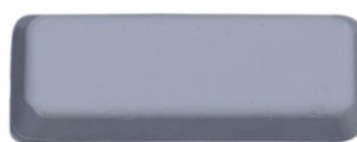
G327 Light Blue Buffing Compound