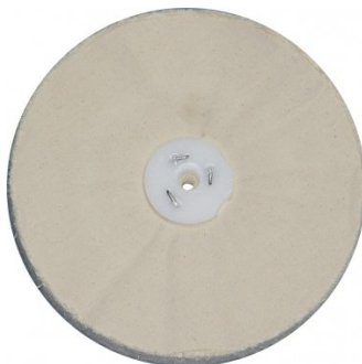
G186A Buffing Mop