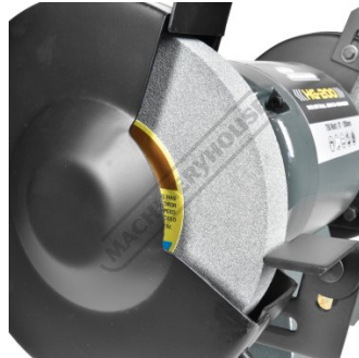
Fine Aluminium Oxide Grinding Wheel