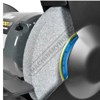
Coarse Aluminium Oxide Grinding Wheel