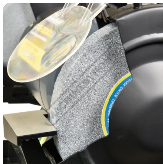
Coarse Aluminium Oxide Grinding Wheel