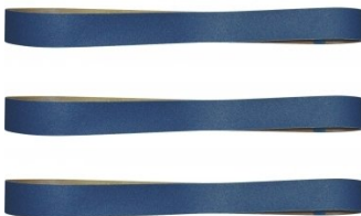
A8041 120G Zirconia Linishing Belt Pack