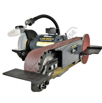
Included Adjustable Tool Rest