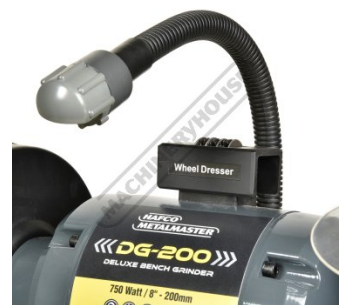
Wheel Dresser Work Light