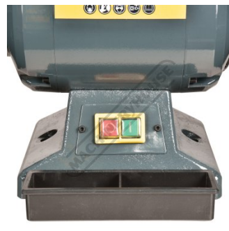
On Off Switch Cooling Tray