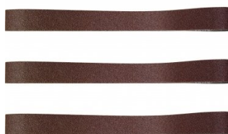
A8033 100G Aluminium Oxide Linishing Belt Pack