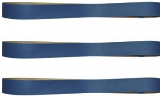
A8037 40G Zirconia Linishing Belt Pack