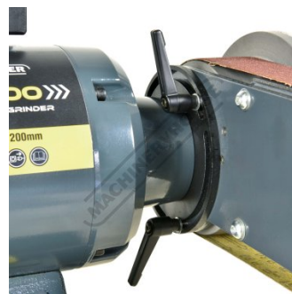
Quick Release Angle Adjustment