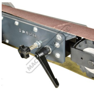
Belt Tensioner Adjustment