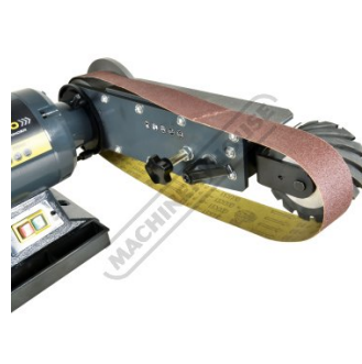
Quick Release Belt