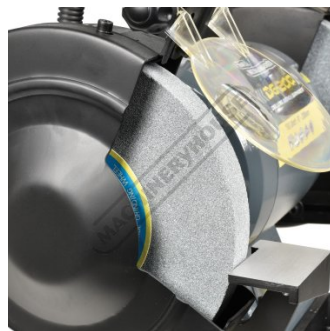
Fine Aluminium Oxide Grinding Wheel