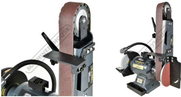
Vertical Position With Tool Rest Mitre Table Vertical Position With Tool Rest Mitre Table