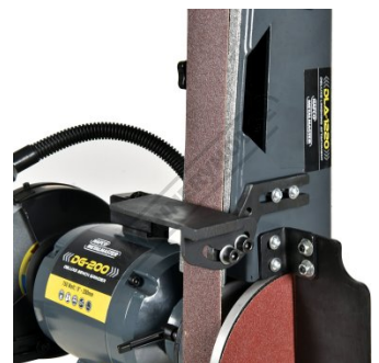
Vertical Position With Tool Rest