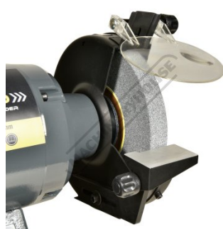
Adjustable Eye Shield Tool Rest