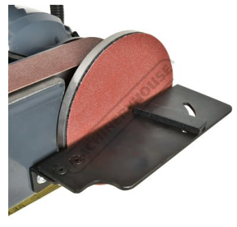
Adjustable Mitre Table