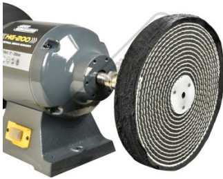
2 Section Buffing Mop Attached To G162