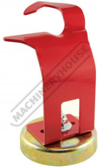
Magnetic Torch Holder