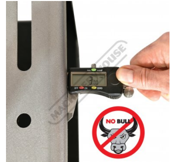
3mm Thick Bench Top