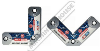
45, 90 & 135 Degree Magnets