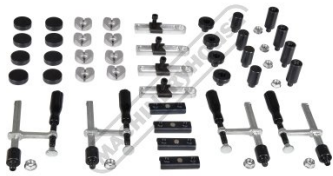
Square & Round Welding Table Clamp Kit