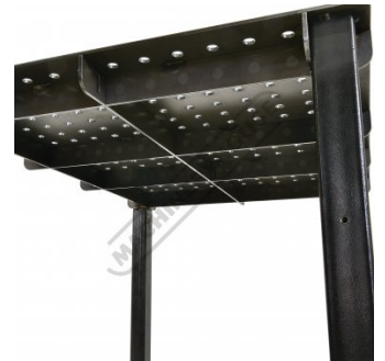
Rib Design for Strength