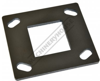
Includes 4 x Base Plates for Optional Castor Wheels