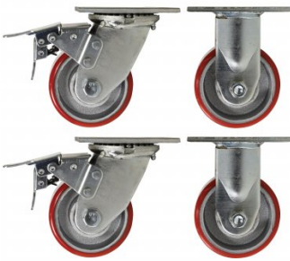
C408 Industrial Caster Wheel Set