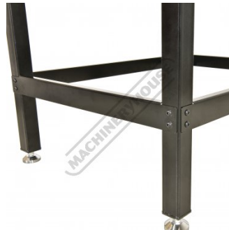
Steel Leg Bracing