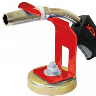
W10362 Magnetic MIG Torch Rest