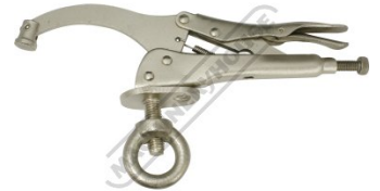
Locking Clamp x 2