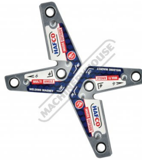
Multi Angle Magnets