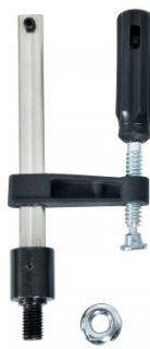
W08509 Weld Clamps with Locking Nuts (2 Piece Pack)