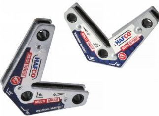
W1082 Multi Angle Corner Magnets - 2pc Pack