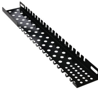
W08524 Welding Clamp Tool Tray