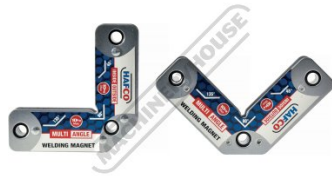
Multi Angle Magnets