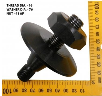
KA1028 ARB NUT FLG DADO 1028 952 953