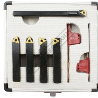
Set in Case