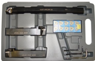
L453 Lathe Turning Tool Kit - 3 piece Insert Type