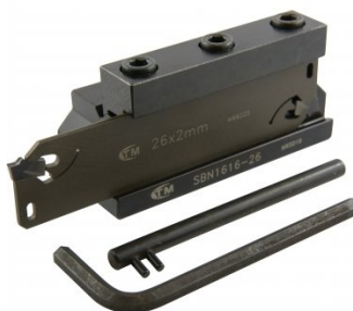
L466 Professional Lathe Parting Tool Kit - Insert Type