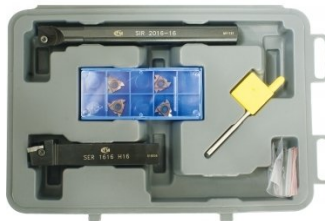
L458 Lathe Threading Tool Kit - Insert Type