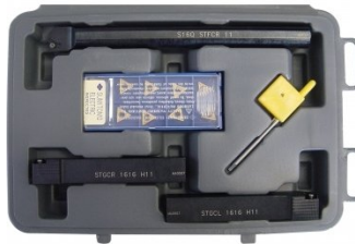
L452 Lathe Turning Tool Kit - 3 piece Insert Type