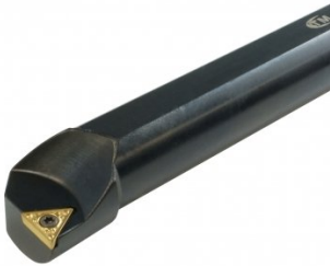
L023 Right Hand Boring Bar