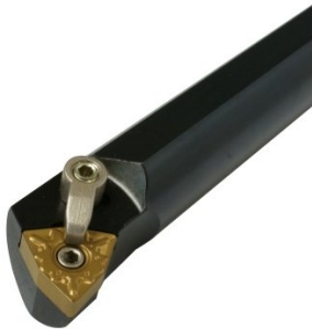
L415 Right Hand Boring Bar