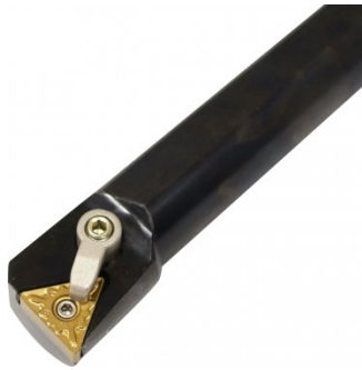
L0235 Right Hand Boring Bar