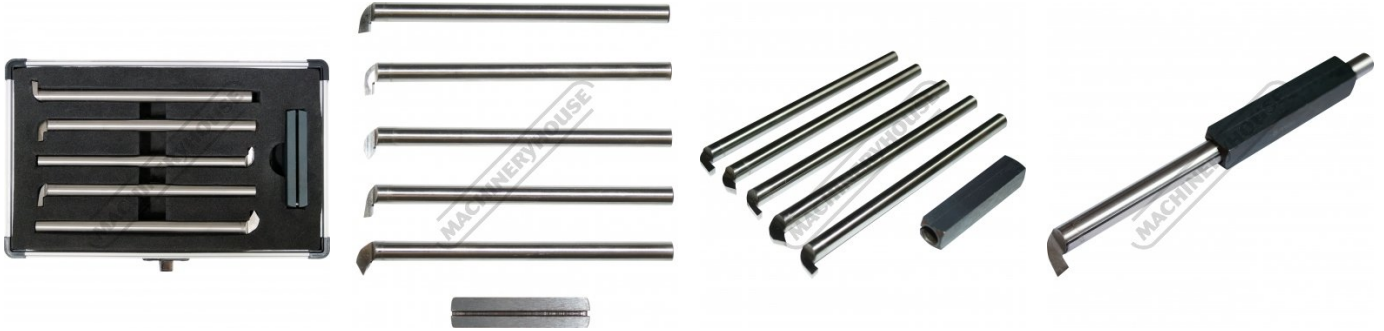
Close Up in Case