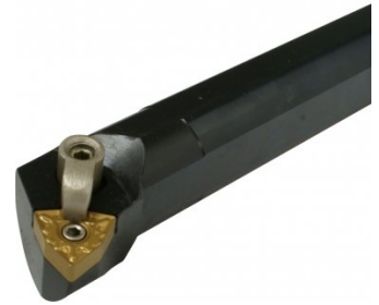
L416 Right Hand Boring Bar