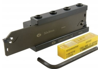
L467 Professional Lathe Parting Tool Kit - Insert Type