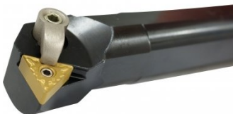
L024 Right Hand Boring Bar