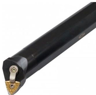
L464 Professional Lathe Parting Tool Kit - Insert Type