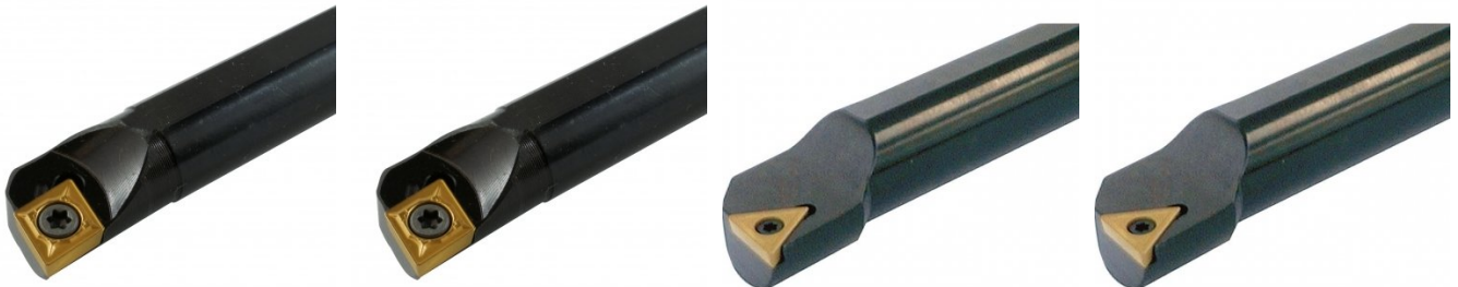
L022 Right Hand Boring Bar