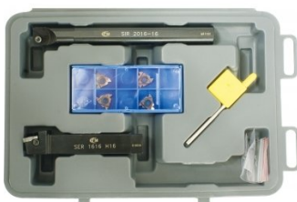
L457 Lathe Threading Tool Kit - Insert Type