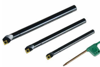
L430 Boring Bar Set - Carbide Insert