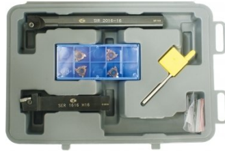
L458 Lathe Threading Tool Kit - Insert Type