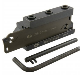
L466 Professional Lathe Parting Tool Kit - Insert Type