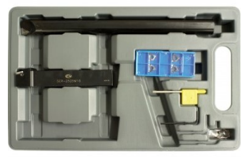
L459 Lathe Threading Tool Kit - Insert Type