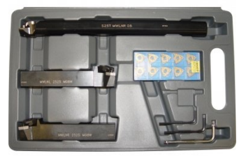
L453 Lathe Turning Tool Kit - 3 piece Insert Type