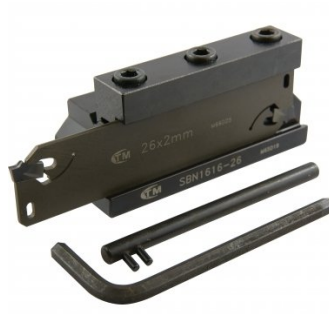
L465 Professional Lathe Parting Tool Kit - Insert Type