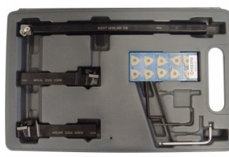
L452 Lathe Turning Tool Kit - 3 piece Insert Type