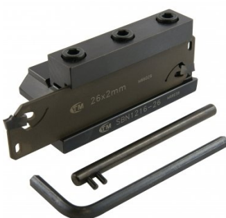
L464 Professional Lathe Parting Tool Kit - Insert Type