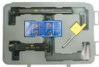
L457 Lathe Threading Tool Kit - Insert Type