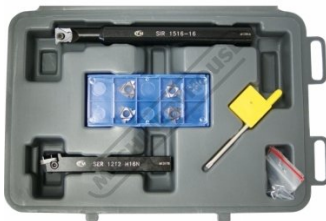
L457 Lathe Threading Tool Kit - Insert Type