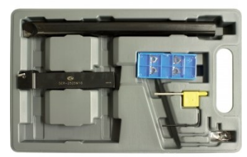
L459 Lathe Threading Tool Kit - Insert Type