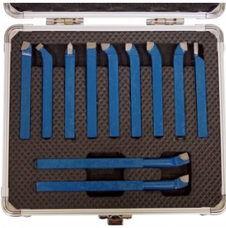
L0085 Carbide Turning Tool Set - 11 piece