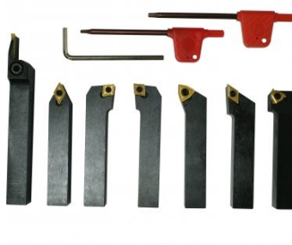
L0099 Lathe Turning Tool Kit - 7 piece Insert Type