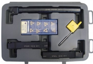
L451 Lathe Turning Tool Kit - 3 piece Insert Type