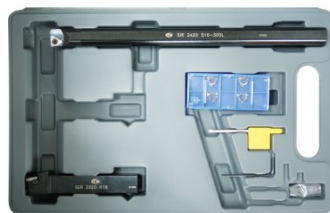
L458 Lathe Threading Tool Kit - Insert Type