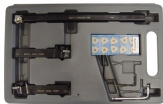
L452 Lathe Turning Tool Kit - 3 piece Insert Type