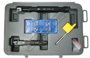
L456 Lathe Threading Tool Kit - Insert Type