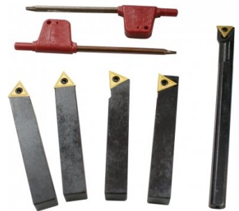
L0055 Lathe Turning Tool Kit - 5 piece Insert Type