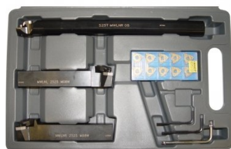
L453 Lathe Turning Tool Kit - 3 piece Insert Type