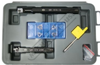
L456 Lathe Threading Tool Kit - Insert Type