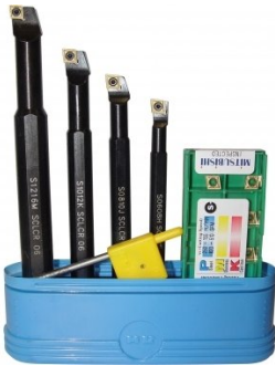
L072 HSS Turning Tool Set - 4 piece