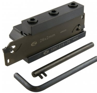
L464 Professional Lathe Parting Tool Kit - Insert Type