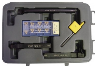
L450 Lathe Turning Tool Kit - 3 piece Insert Type