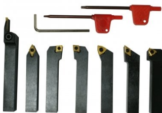
L0099 Lathe Turning Tool Kit - 7 piece Insert Type