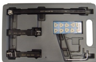
L452 Lathe Turning Tool Kit - 3 piece Insert Type