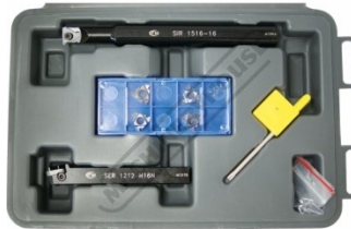
L457 Lathe Threading Tool Kit - Insert Type