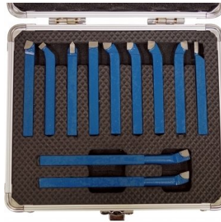
L0085 Carbide Turning Tool Set - 11 piece