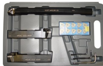
L453 Lathe Turning Tool Kit - 3 piece Insert Type