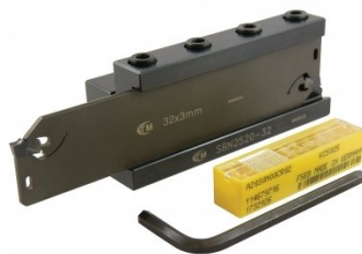
L467 Professional Lathe Parting Tool Kit - Insert Type