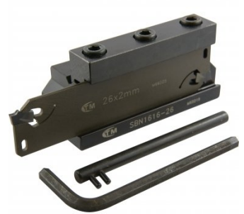
L465 Professional Lathe Parting Tool Kit - Insert Type