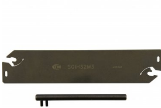
L4693 Parting Blade